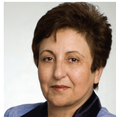
Shirin Ebadi, J.D.