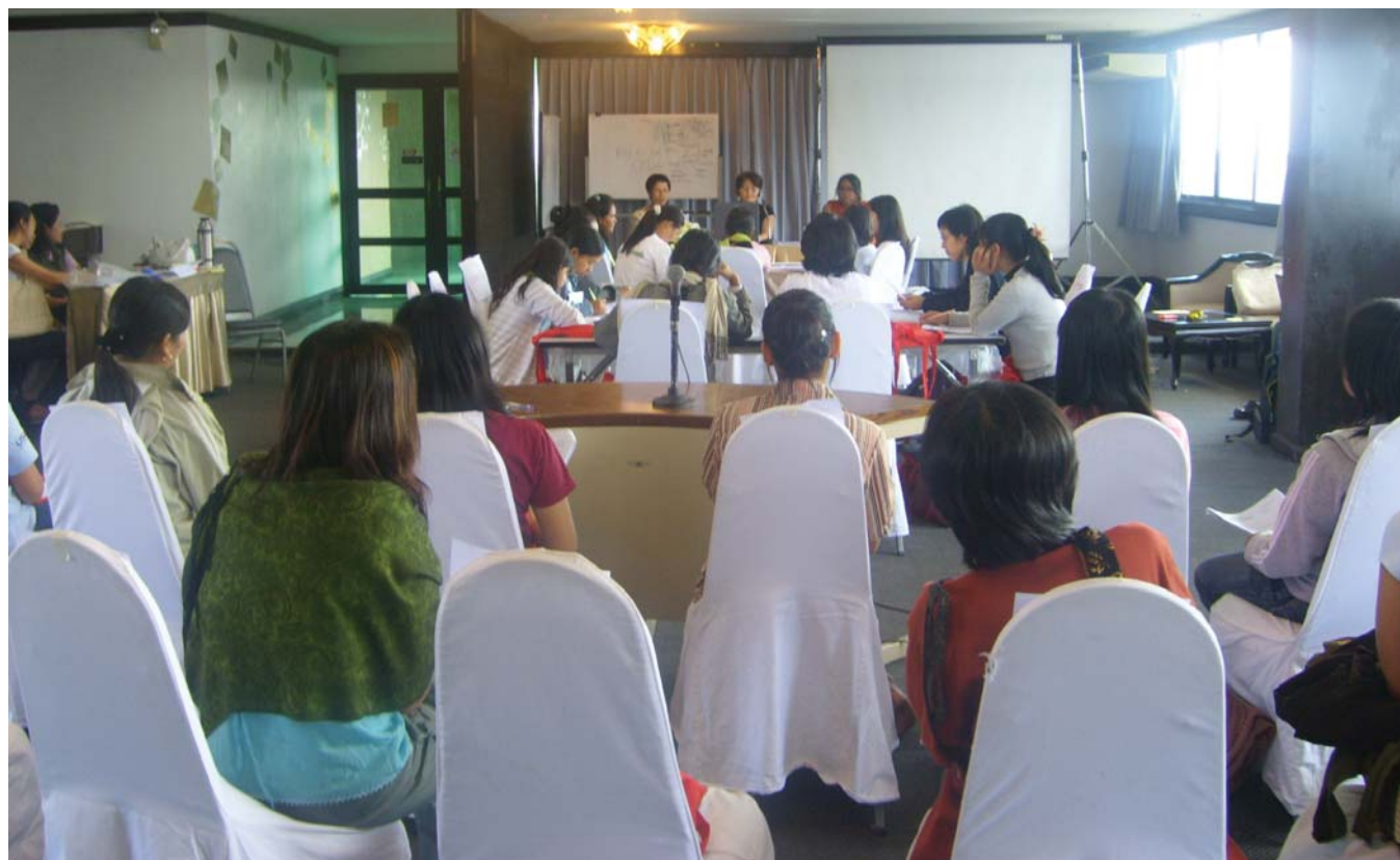
Mock CEDAW Country Review Session