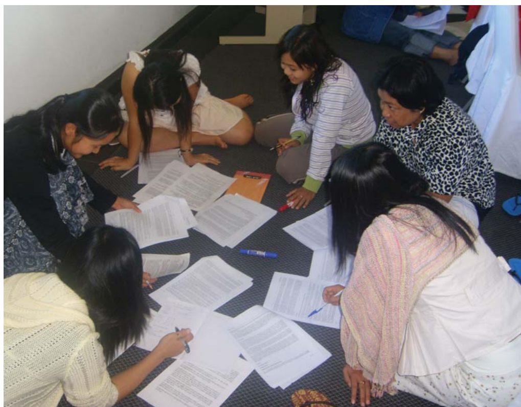
Participants reviewing SPDC report